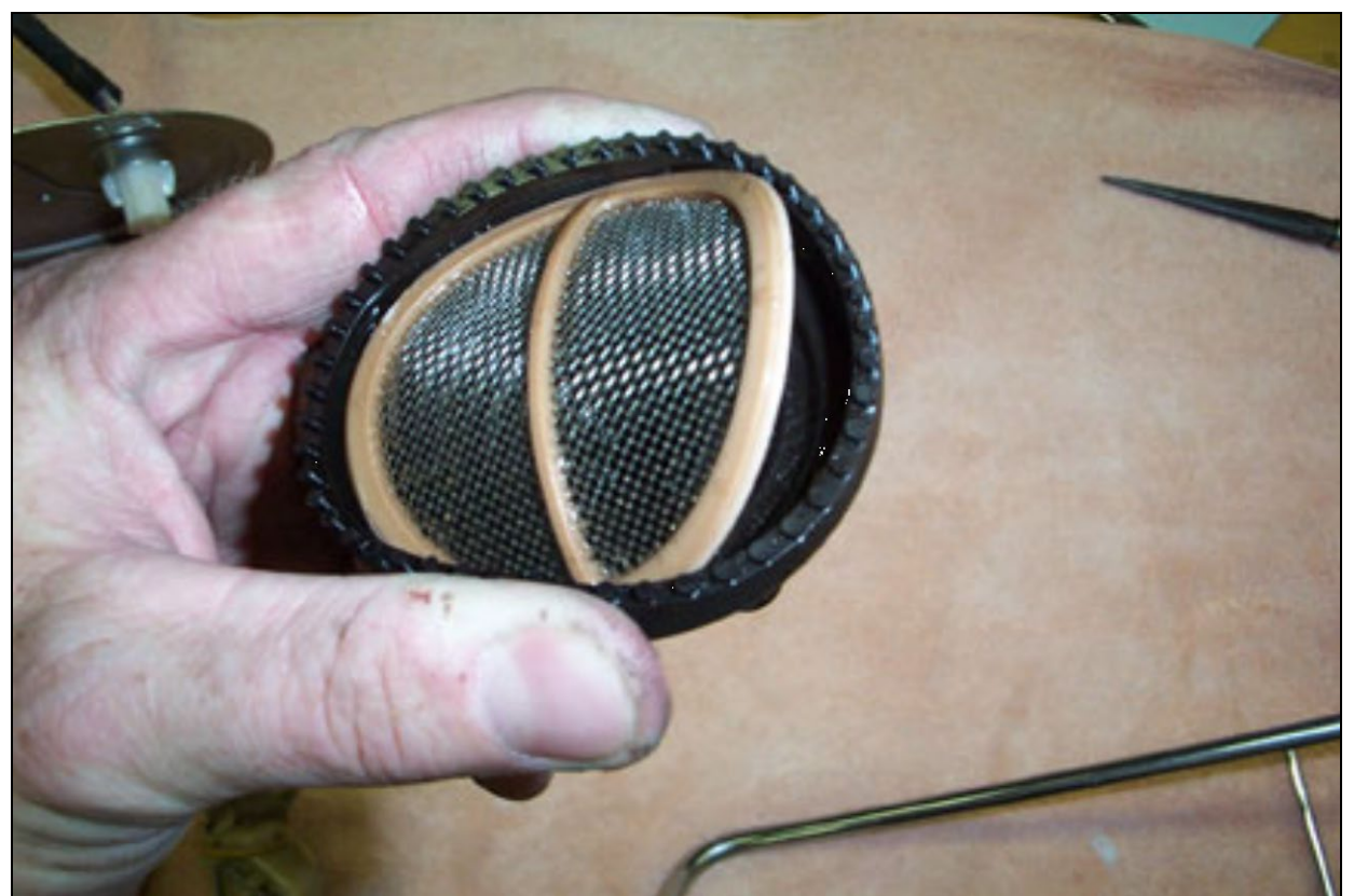
Figure 7 – Removing Filter Screen From Strainer