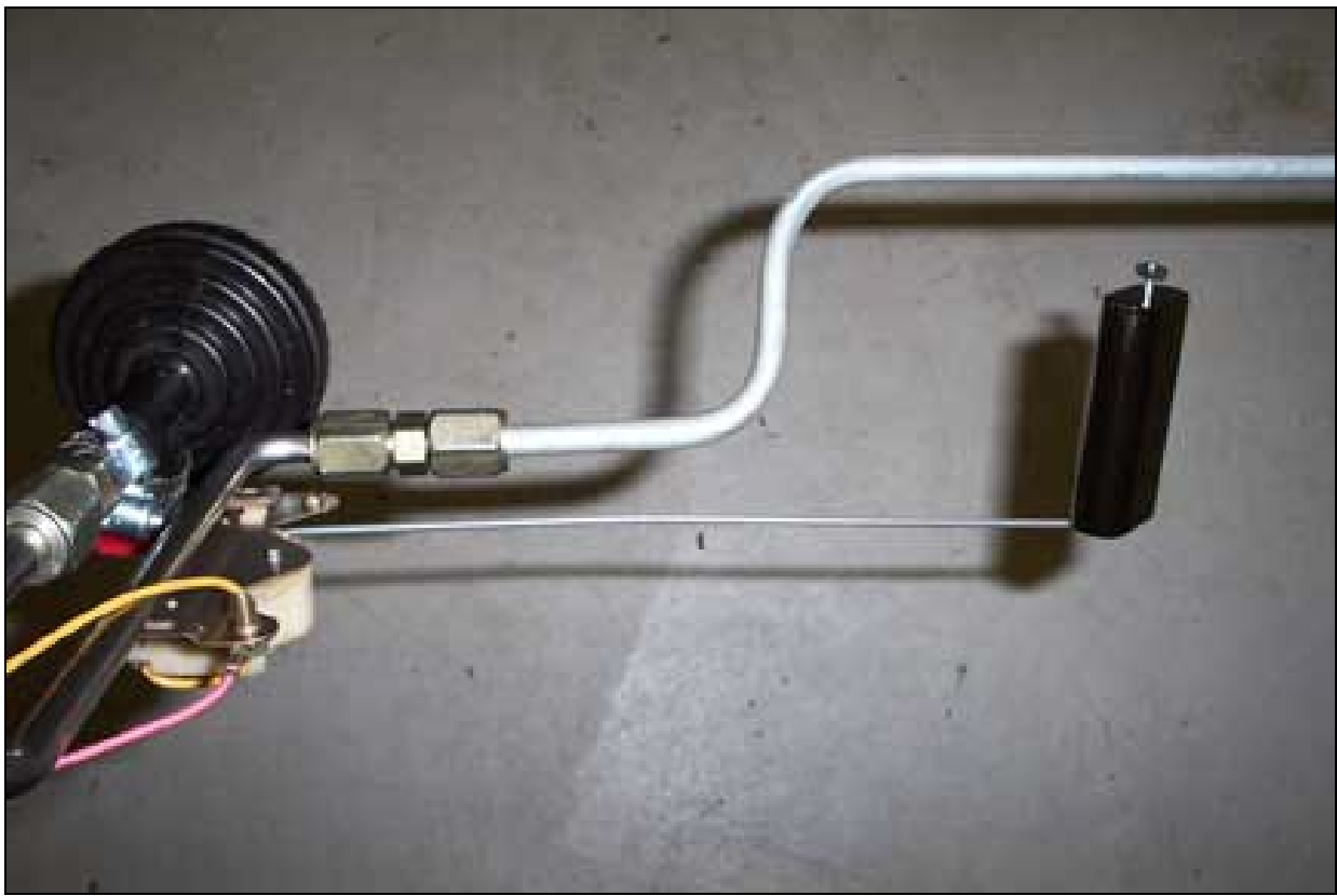
Figure 6 – Return Tube Assembly Installed (Pickup and Excursion ONLY)