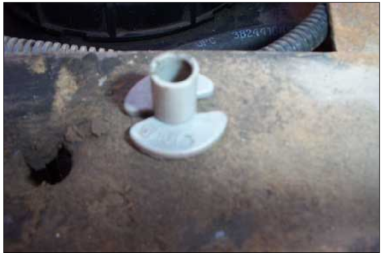
Figure 1- Line Release Tool