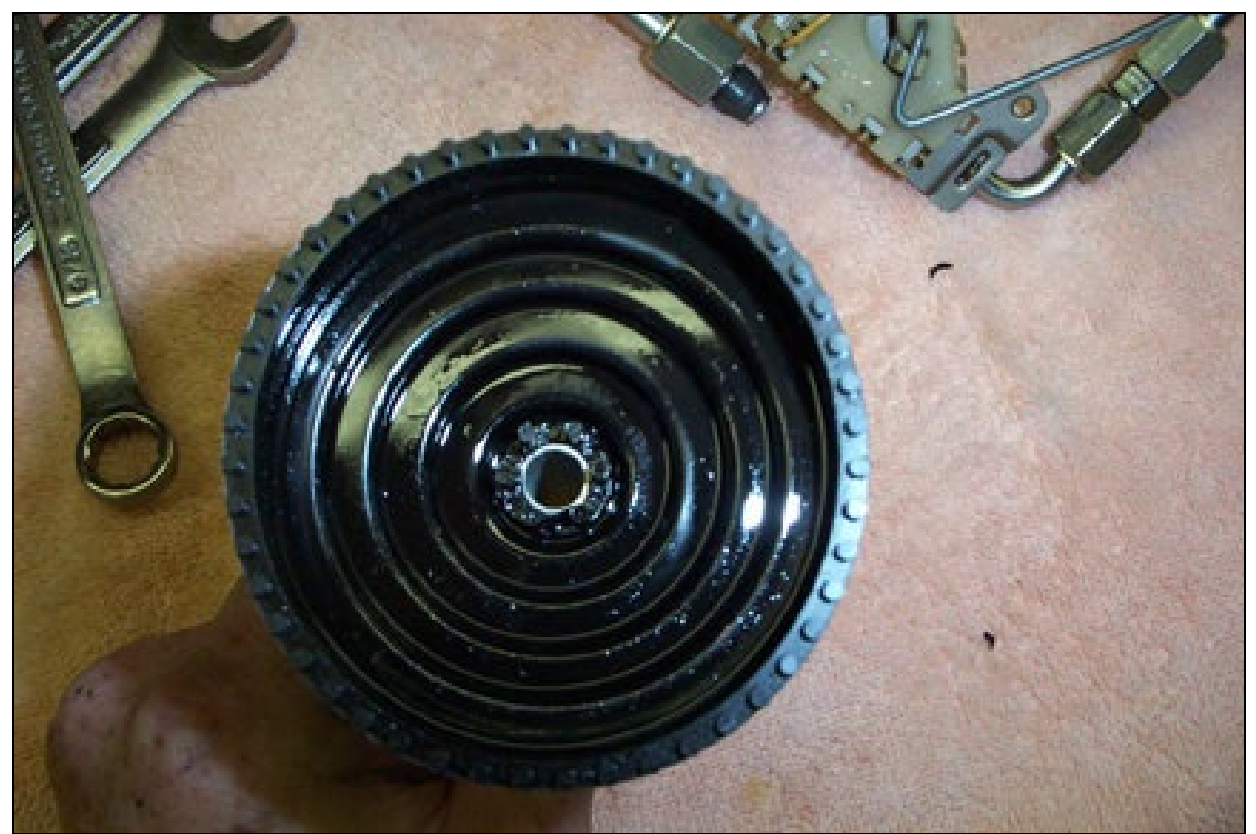
Figure 9 – Pickup Tube Installed in Strainer