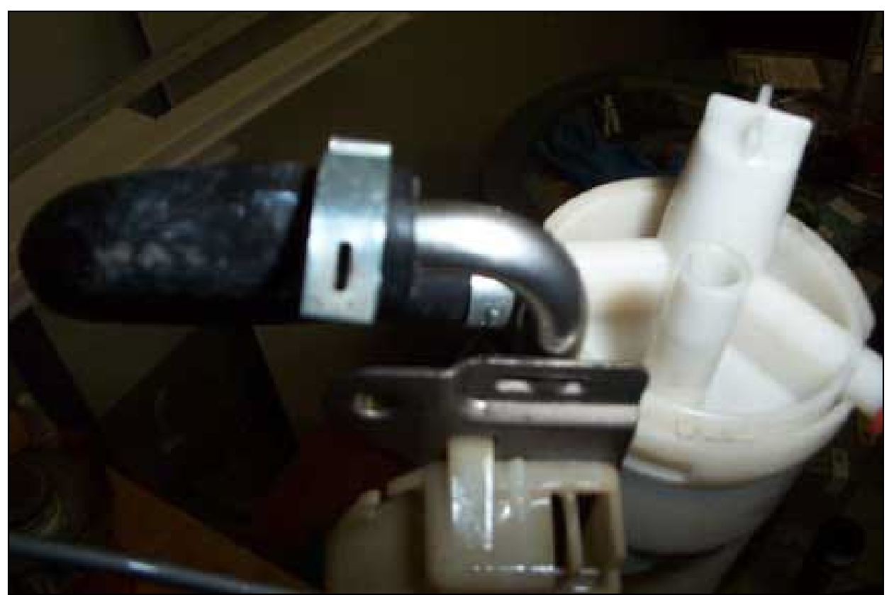
Figure 4 - Cutting The Factory Return Line Hose Clamp