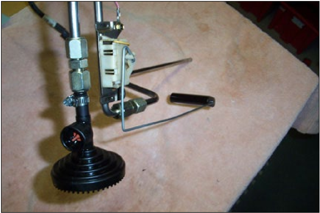
Figure 10 – Sending Unit Assembly Ready for installation