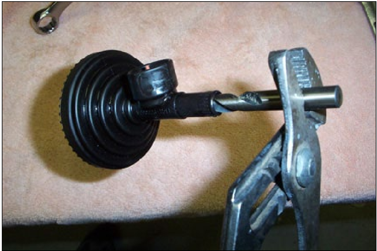
Figure 8 – Clearancing Pickup Strainer for Pickup Tube