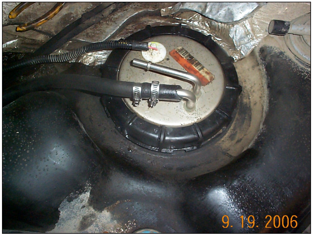
Figure 13 – New Fuel Line Double Clamped on Pickup Tube (Excursion Shown)