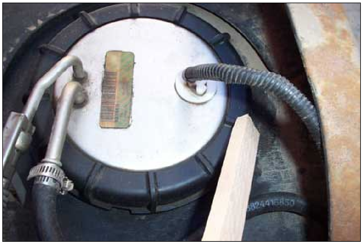
Figure 2 - Removing The Sending Unit Retention Ring