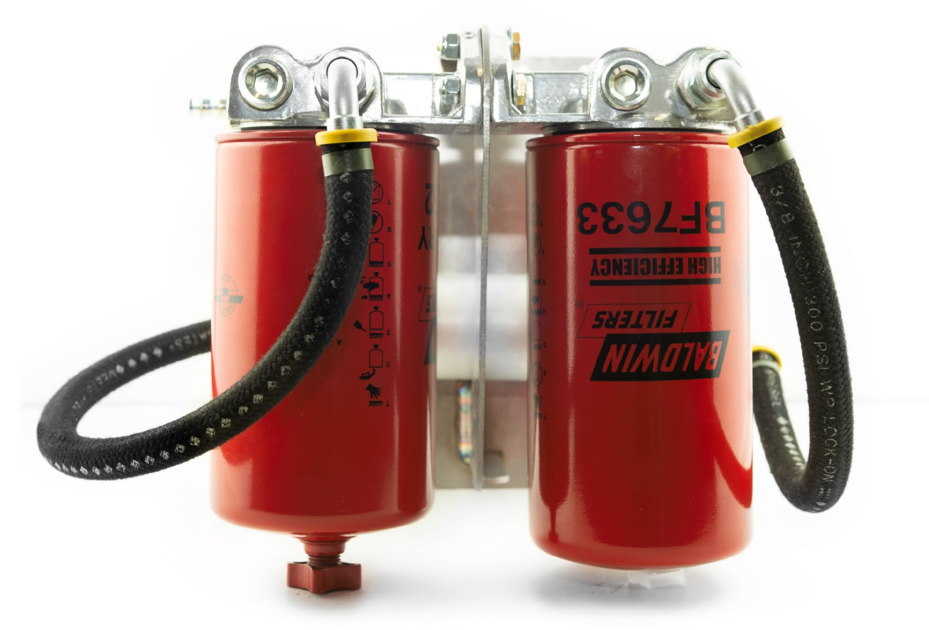
Figure 12 – "Inside the Frame" Orientation – Pump Inlet on Left – Pump Outlet on Right