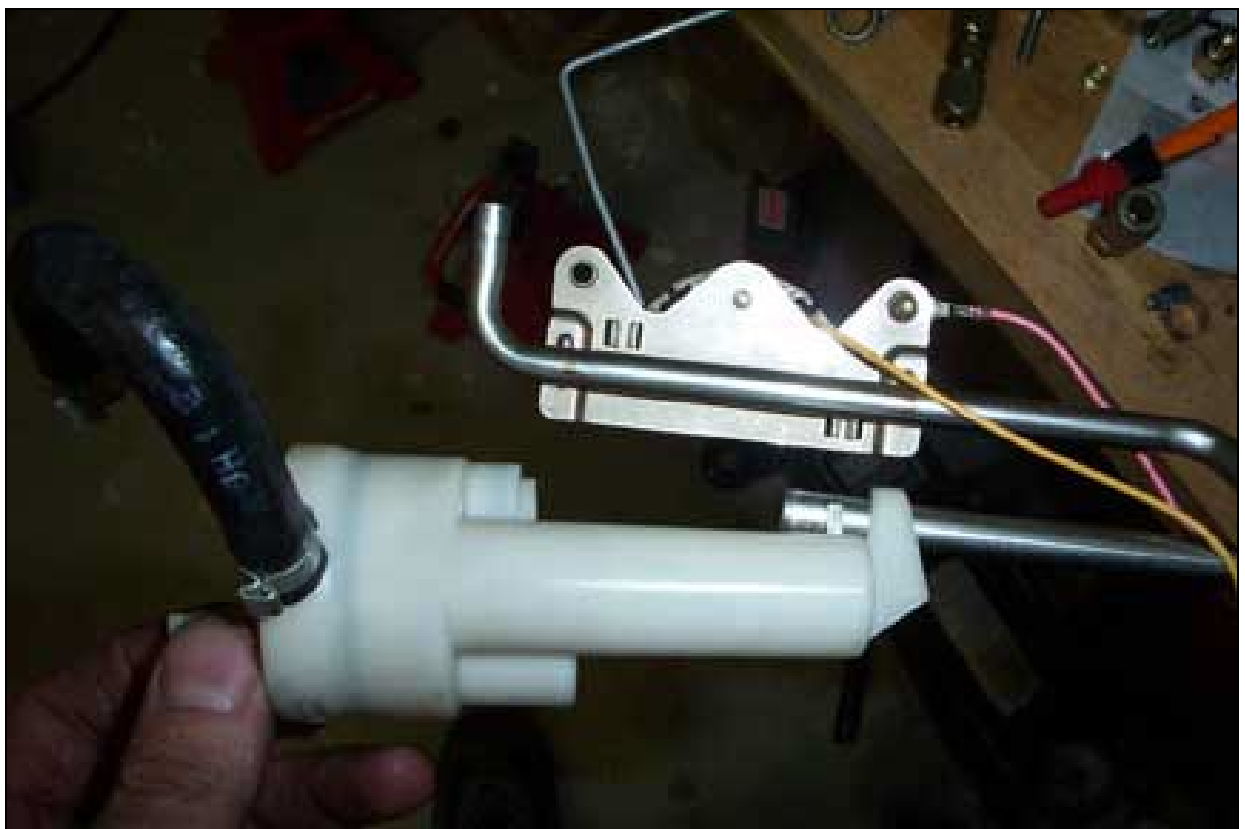
Figure 5 - Removing The Mixing Chamber